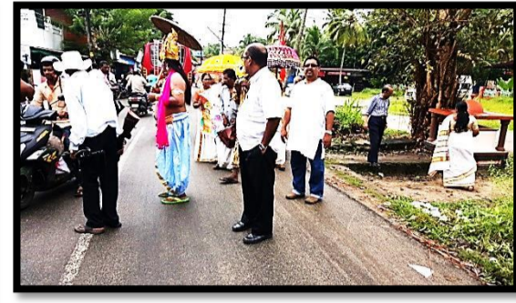
King Starting His Journey from Onattukara

A formal meeting was held along with Rotary members, Panchayat & Block Panchayat Leaders invited by the Pakalveedu officials to the dais to start the Onam function.