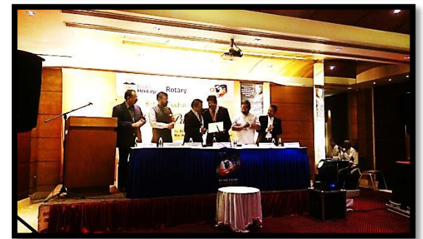
Charter presentation of new Rotary club Rotary Club Cochin Heritage

Celebrated on the first day of Medam or the Malayalam month or between the months of April and May of the Gregorian calendar, Vishu symbolizes the beginning of the spring season. Vishu, a Hindu festival, is celebrated in Kerala as the harvest festival and the astrological New Year of the Malayalis. Vishu indicates the movement of the sun to Aries or the Mesha Rashi and marks the day from which the farmers begin the ploughing of land and other agricultural activities.