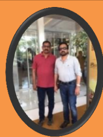
Pilgrims returned from Thirupathi