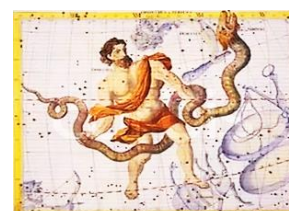
Ophiuchus the 13th Zodiac Sign

Ophiuchus is based on a constellation of the same name, which is also known as Serpent- bearer in Greek.