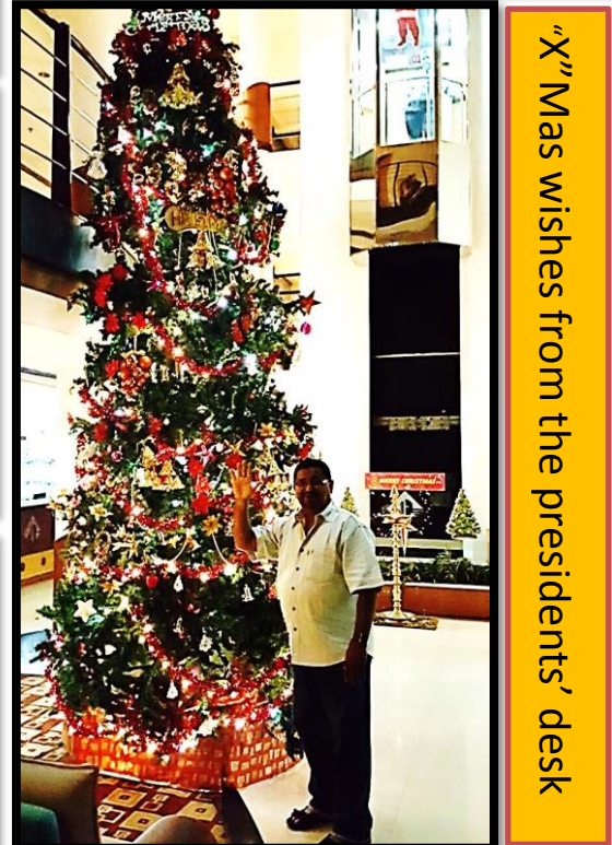
"X" Mas wishes from the presidents' desk