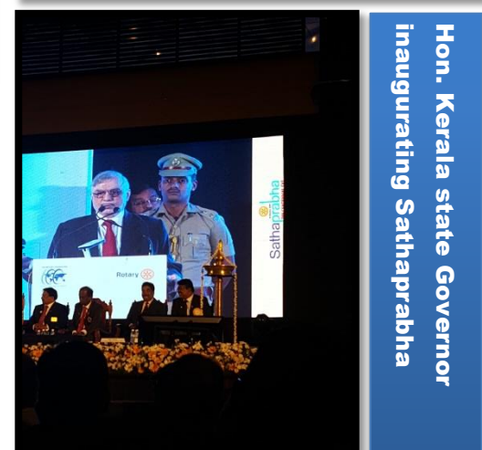
Hon. Kerala state Governor Inaugurating Sathaprabha